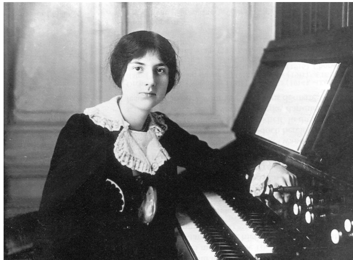
Boulanger's official portrait as winner of the 1913 Prix de Rome

The legacy of Lili Boulanger is intertwined deeply with her sister's. Nadia herself gave up composing in 1922, but through her long career of teaching composition she arguably shaped the future of classical music more than any single person during the 20th century. Nadia was directly responsible for the performance and publication of her younger sister's compositions. She edited and occasionally transcribed manuscripts, and oversaw recordings of Lili's music, sharing her sister's work with the hundreds of composition students she taught until her death in 1979 — and with the larger public through annual concerts she organized in remembrance of Lili.